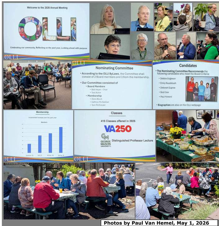
May 1, 2026

Website Catalog DocStore Facebook Officials Member Portal Contact Us