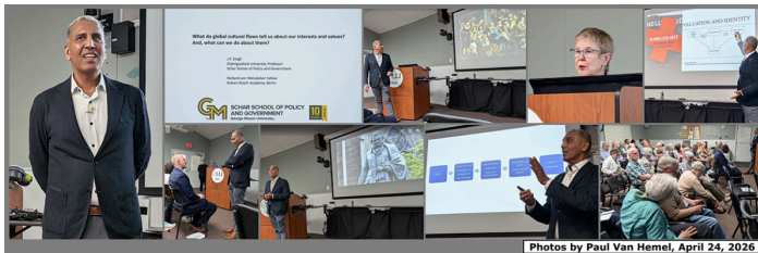
April 24, 2026

Website Catalog DocStore Facebook Officials Member Portal Contact Us