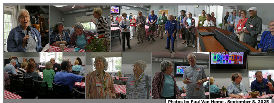
September 8, 2025

Website Catalog DocStore Facebook Officials Member Portal Contact Us