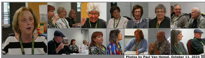
October 11, 2024

Website Catalog DocStore Facebook Officials Member Portal Contact Us