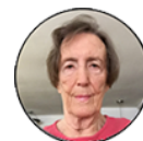
By Betty Ellerbee, Tallwood Book Club Coordinator

The Tallwood Book Club will meet in person on campus in October and November. We are assigned to the Cottage for meetings but can meet outdoors on the parking lot island if the weather permits.