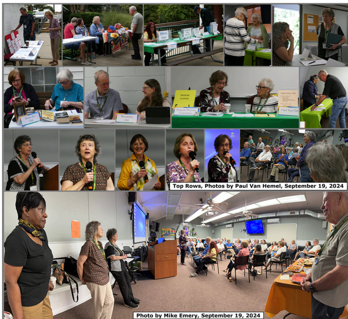
Continuing Members Welcome New Members at OLLI Fall Kick-Off Coffee and Activities Fair at Tallwood, September 19

Website Catalog DocStore Facebook Officials Member Portal Contact Us