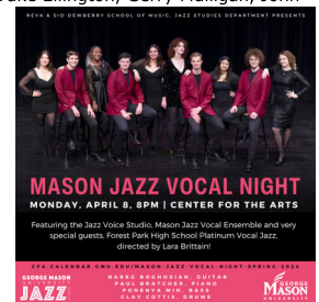
Back to Top of Page

$12 General Public, $8 Seniors, $5 Students