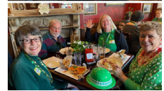
Back to Top of Page