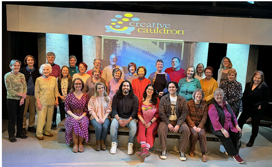
Back to Top of Page