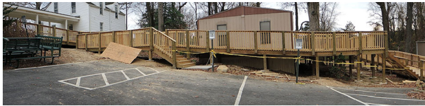
Tallwood ramp built by Mason Facilities Management for Americans with Disabilities Act compliance is nearing completion as shown in panoramic view

Website Quick Links Catalog DocStore Facebook Officials Member Portal Contact Us Loudoun Newsletter