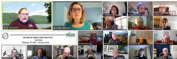
Board of Directors Meeting February 19 (See Highlights Article Below)

Website What's New Catalog DocStore Facebook Officials Member Portal Contact Us Loudoun Newsletter