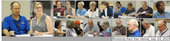
Board of Directors Meeting, Tallwood, July 19 (See Article Below for Board Meeting Highlights)

Website What's New Catalog Doc-Store Facebook Officials Member Portal Contact Us Loudoun Newsletter