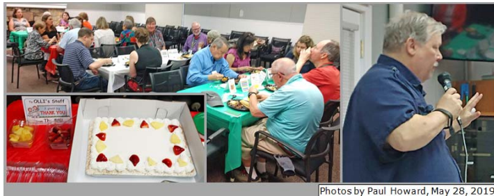
May 28, 2019

Website What's New Catalog DocStore Facebook Officials Member Portal Contact Us Loudoun Newsletter