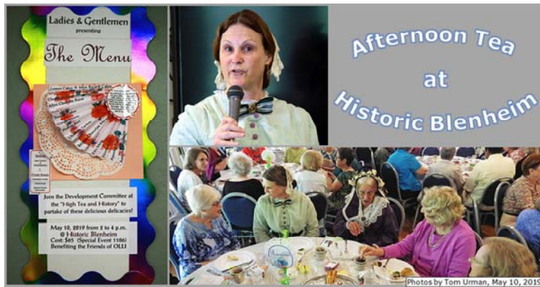
Special Event: Afternoon Tea and History at Historic Blenheim, May 10

Website What's New Catalog DocStore Facebook Officials Member Portal Contact Us Loudoun Newsletter