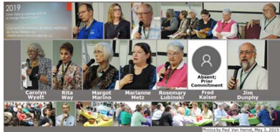
Annual Business Meeting and Picnic with Board Candidates, Tallwood, May 3

Website What's New Catalog Doc-Store Facebook Officials Member Portal Contact Us Loudoun Newsletter