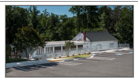
Fairfax – "Tallwood" 4210 Roberts Road, Fairfax, VA 22030