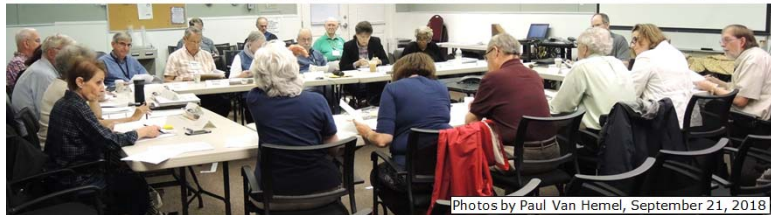
September 21, 2018