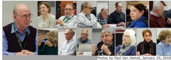
January 19, 2018

Website What's New Catalog DocStore Facebook Officials Member Portal Contact Us