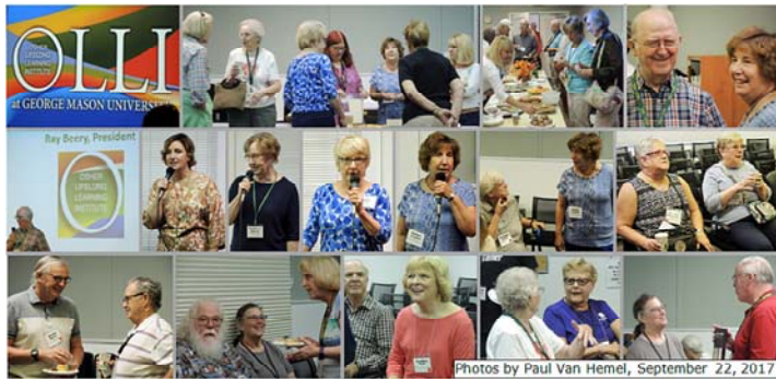
OLLI Kick-off Coffee, Tallwood, September 22

Website What's New Catalog DocStore Facebook Officials Member Portal Contact Us