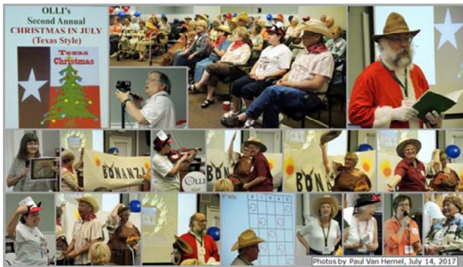
Christmas in July Celebration, Texas Style, Tallwood, July 14; More Photos Available at This Link

Website What's New Catalog DocStore Facebook Officials Member Portal Contact Us