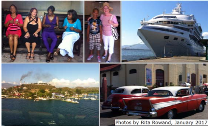
January 2017