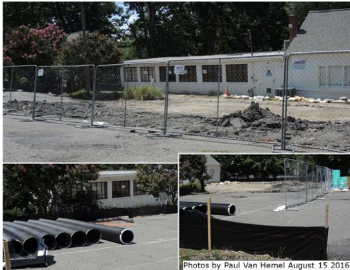
August 15 2016

Website What's New Catalog DocStore Facebook Officials Member Portal Contact Us