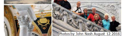
August 12 2016

course, the publicly displayed Gutenberg Bible. The Library of Congress is the official research library for the United States Congress and the second largest library in the world by collection size, after the British Library, with a total of more than 160,775,400 items.