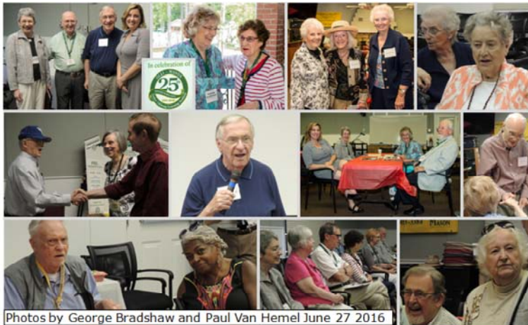
June 27 2016