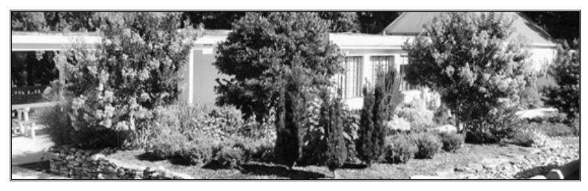
Fairfax – "Tallwood" 4210 Roberts Road - Fairfax, VA 22030