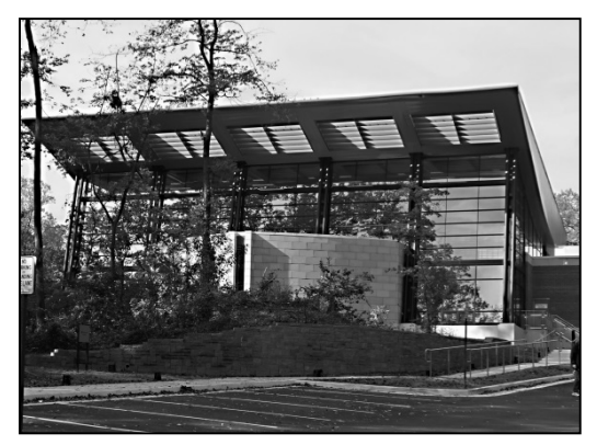
Reston - United Christian Parish Church 11508 North Shore Drive, Reston, VA 20190