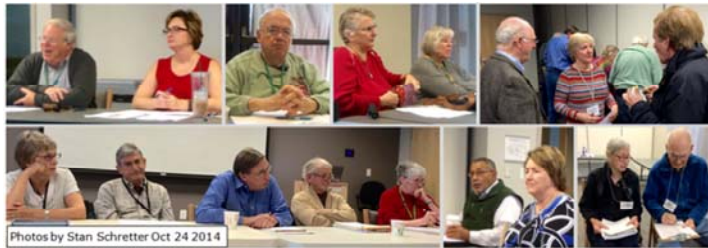
Oct 24 2014

Website What's New Catalog DocStore Facebook Officials Member Portal Contact Us