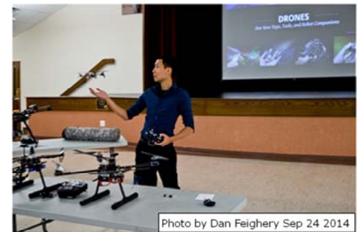
Sep 24 2014