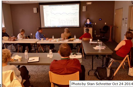
Oct 24 2014

The Board met Friday October 24 at Reston. Recent safety issues at Tallwood regarding parking as well as pedestrian safety were discussed. Steps are being taken to address these issues.