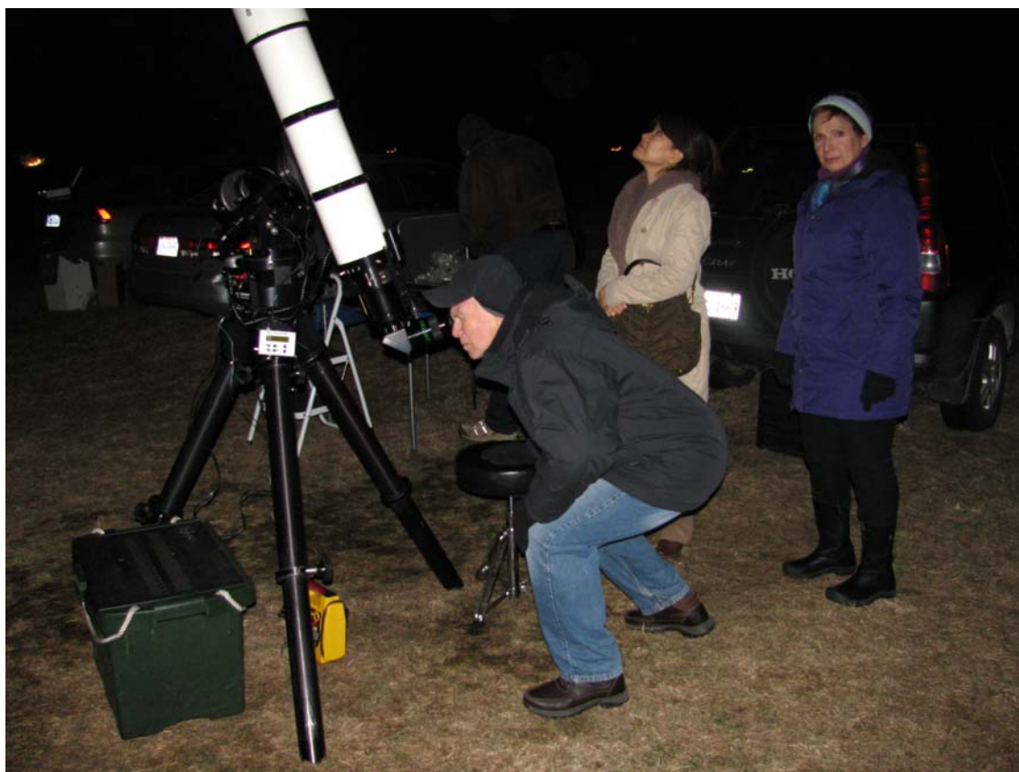
A field trip to Observatory Park

Website What's New Catalog DocStore Facebook Spiritwear Member Portal Contact Us