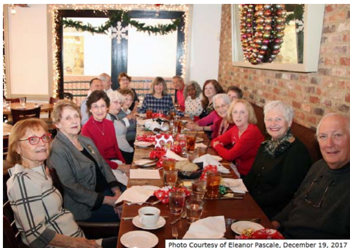
December 19, 2017

Website What's New Catalog DocStore Facebook Officials Member Portal Contact Us