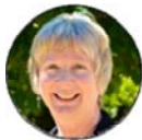
By Rita Rowand, Mason Cultural Tours Manager

I recently escorted a group to southern France and northern Italy (see pictures below). In addition to visits to some spectacular locations, the 16 travelers