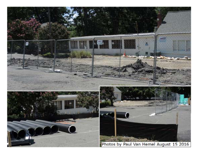
Parking Lot Reconstruction Underway at Tallwood, August 15, 2016

Website What's New Catalog DocStore Facebook Officials Member Portal Contact Us