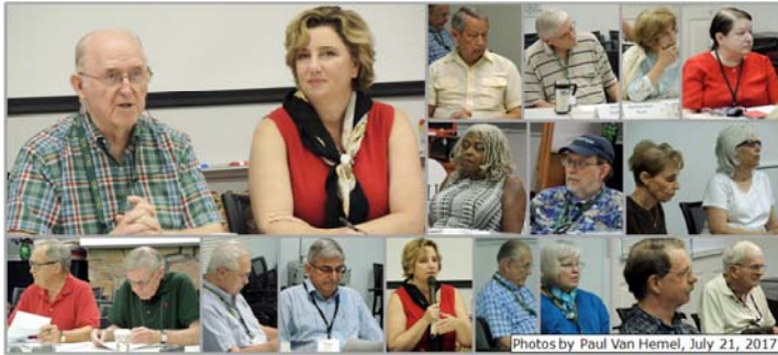
July 21, 2017

Website What's New Catalog DocStore Facebook Officials Member Portal Contact Us