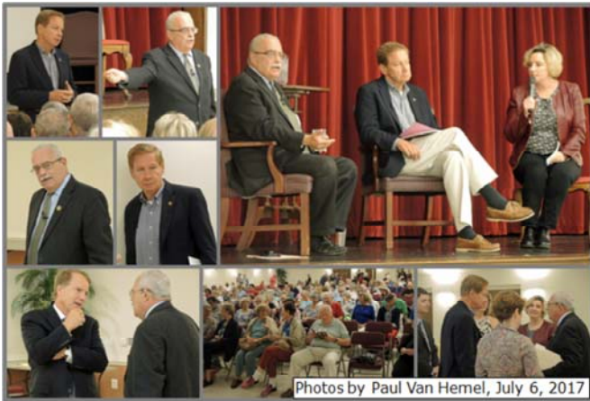
July 6, 2017

Website What's New Catalog DocStore Facebook Officials Member Portal Contact Us