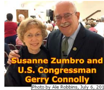
July 6, 2017

the audience regarding healthcare, Korea, Syria, the President's budget, and "fake news," among other things. While they provided different perspectives on many of the concerns, their discourse was friendly, and they even admitted they would be able to find compromise on most if they took the time to sit down and sincerely hash them out together. Sage advice coming from seasoned statesmen, and a message more of our elected officials should heed.