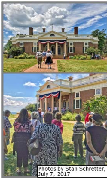
July 7, 2017