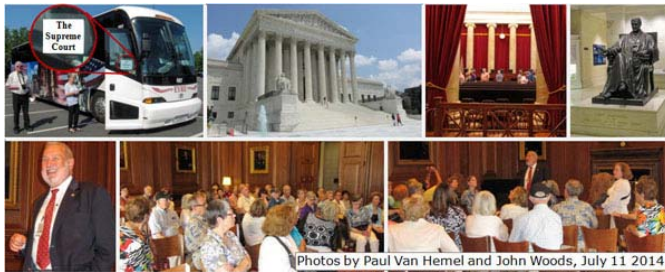
July 11 2014

Website What's New Catalog DocStore Facebook Officials Member Portal Contact Us