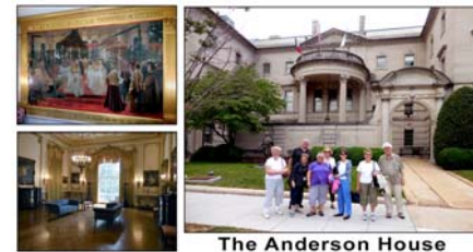
The Anderson House