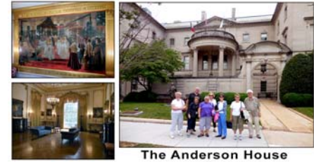
The Anderson House