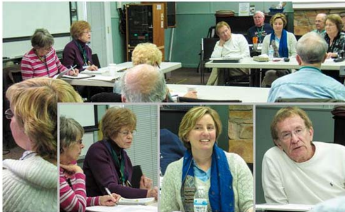
Board of Directors Meeting, January 17, 2014

Website What's New Catalog DocStore Facebook Spiritwear Member Portal Contact Us