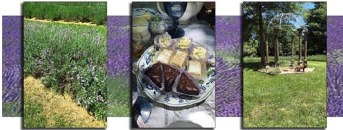
Tea and Scones in the Gardens at Blooming Hill Lavender Farm in Philomont, Purcellville, VA, were enjoyed by members during an OLLI bus trip on Friday, June 15

Website What's New Catalog DocStore Facebook Officials Member Portal Contact Us Loudoun Newsletter