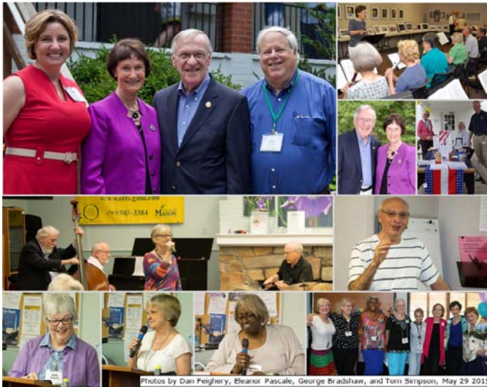
May 29 2015

Website What's New Catalog DocStore Facebook Officials Member Portal Contact Us