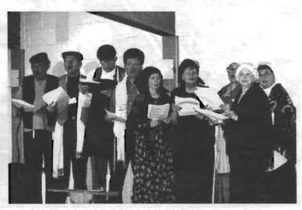
The Reader's Theater group performs scenes from Fiddler on the Roof.