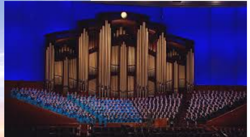
The Salt Lake Temple And the Mormon Tabernacle Choir

“And it shall come to pass in the last days, that the mountain of the Lord’s house shall be established in the top of the mountains, and shall be exalted above the hills; and all nations shall flow unto it.” (Isaiah 2:2)