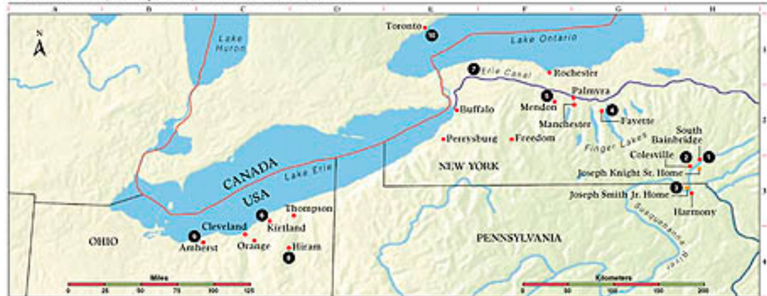
3. The New York, Pennsylvania, and Ohio Area of the USA