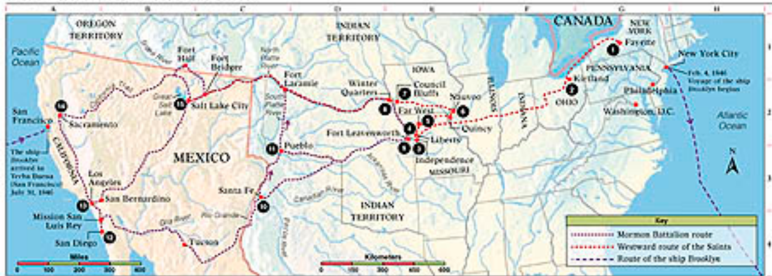
6. The Westward Movement of the Church