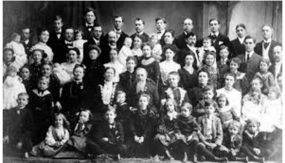
Joseph F. Smith, Joseph Smith, Jr.'s nephew and 6 th President of the Church, and his family.