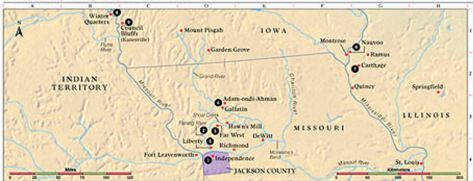
5. The Missouri, Illinois, and Iowa Area of the USA