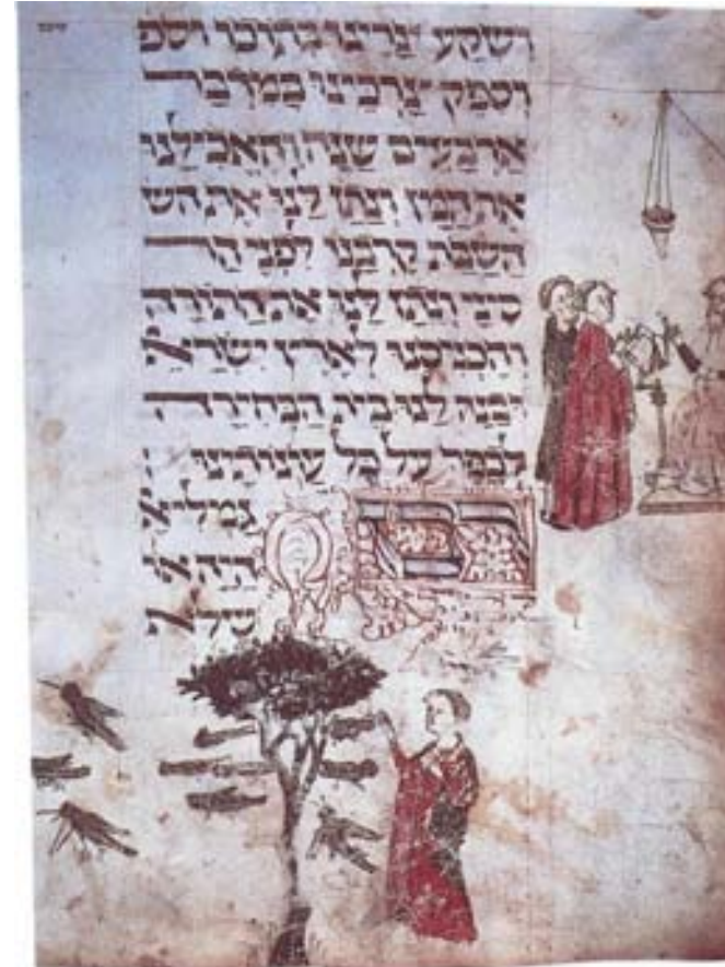
Fig. 20. Babban Gensel, Schocken Haggadah, Lombardy, end of 14th century. Jerusalem, Schocken Library, MS 24085, fol. 23r.