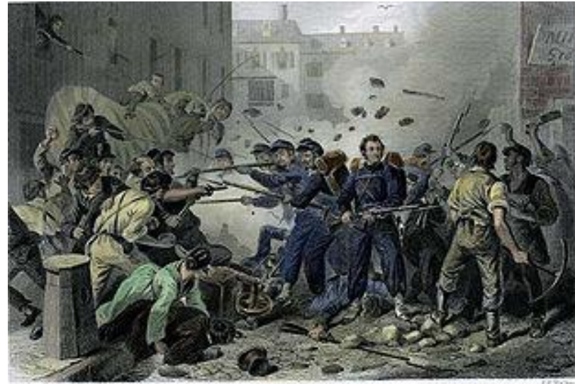
MASSACHUSETTS SOLDIERS MARCHING THROUGH BALTIMORE.