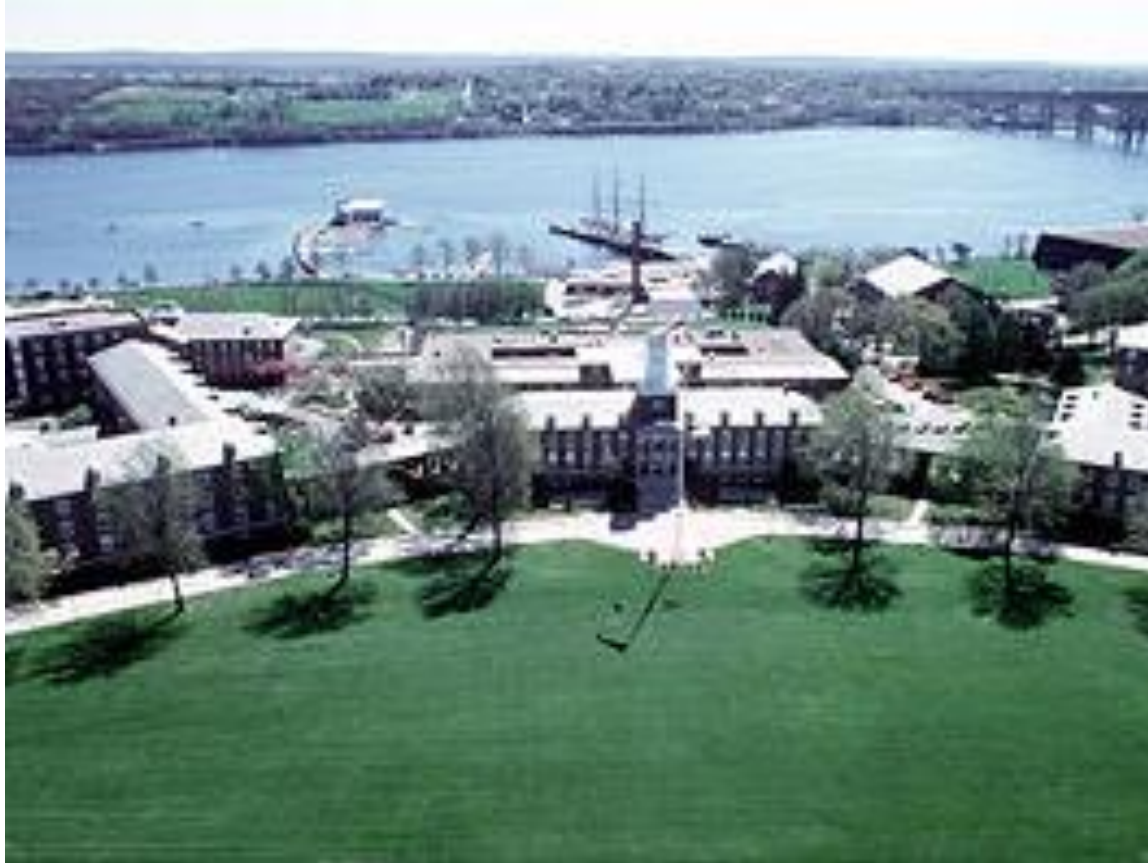
Overview of USCGA and the Thames River