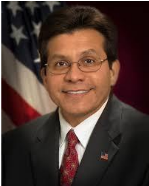
Alberto Gonzalez US Attorney General