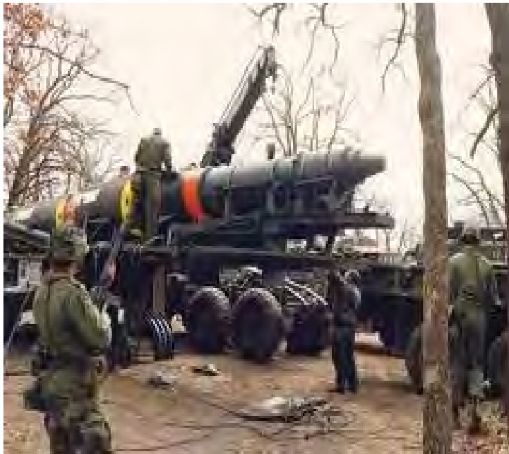
PERSHING II BALLISTIC MISSILE