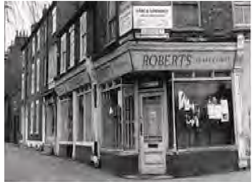
PHOTO OF THE STORE