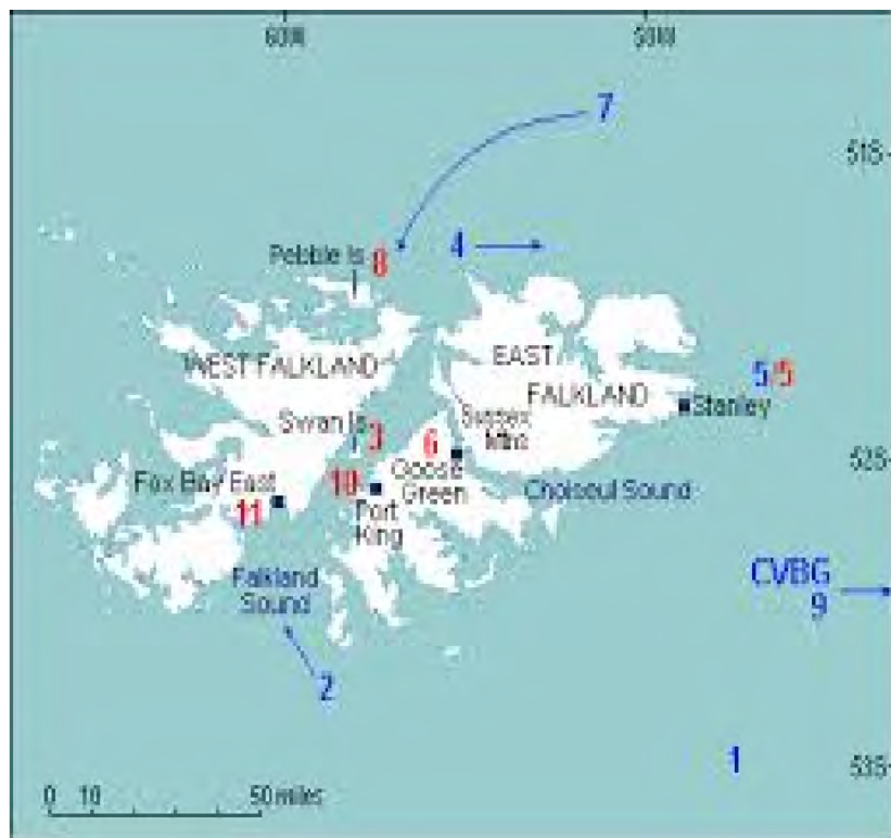
MAP SHOWING PEBBLE ISLAND