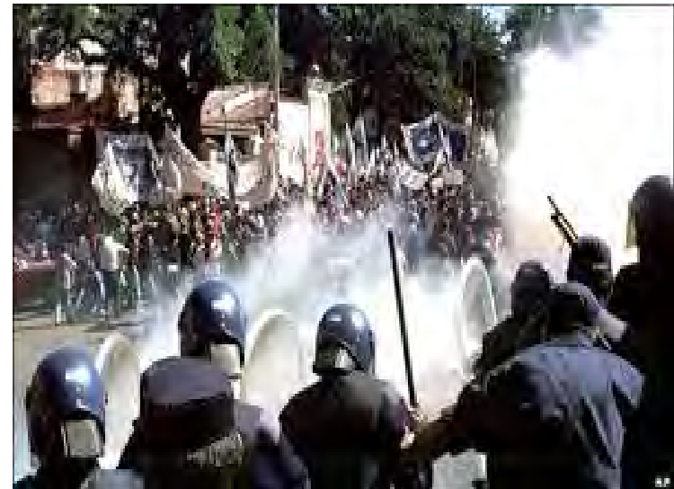
PHOTO OF UNREST