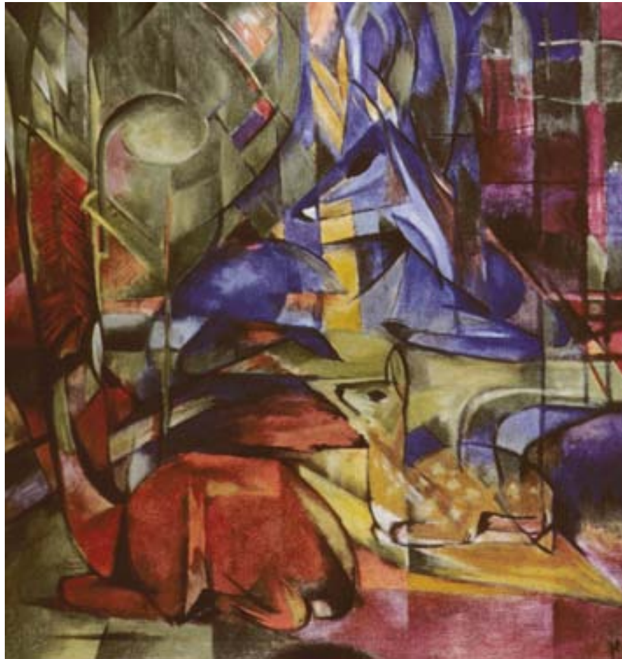
Deer in Forest, 1913-14