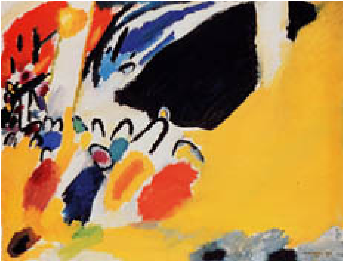
Kandinsky, Impression III, (Concert) 1911