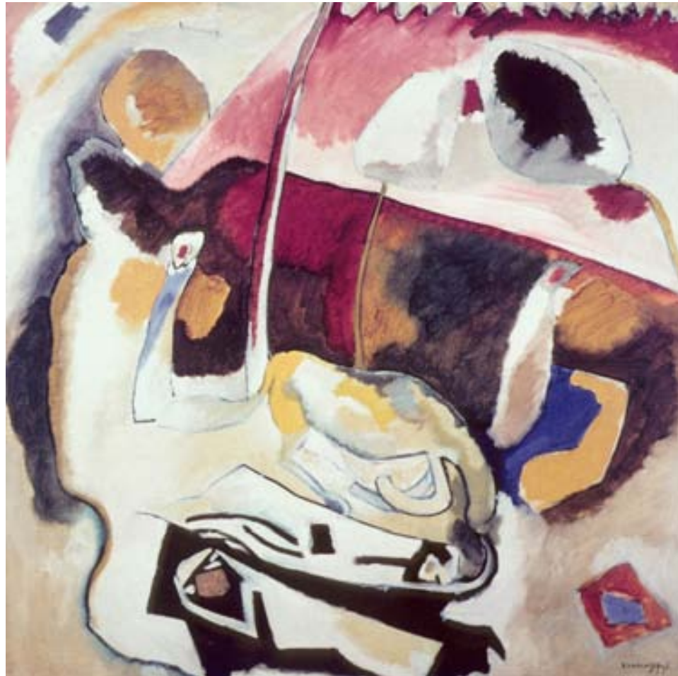
Improvisation 21, 1911