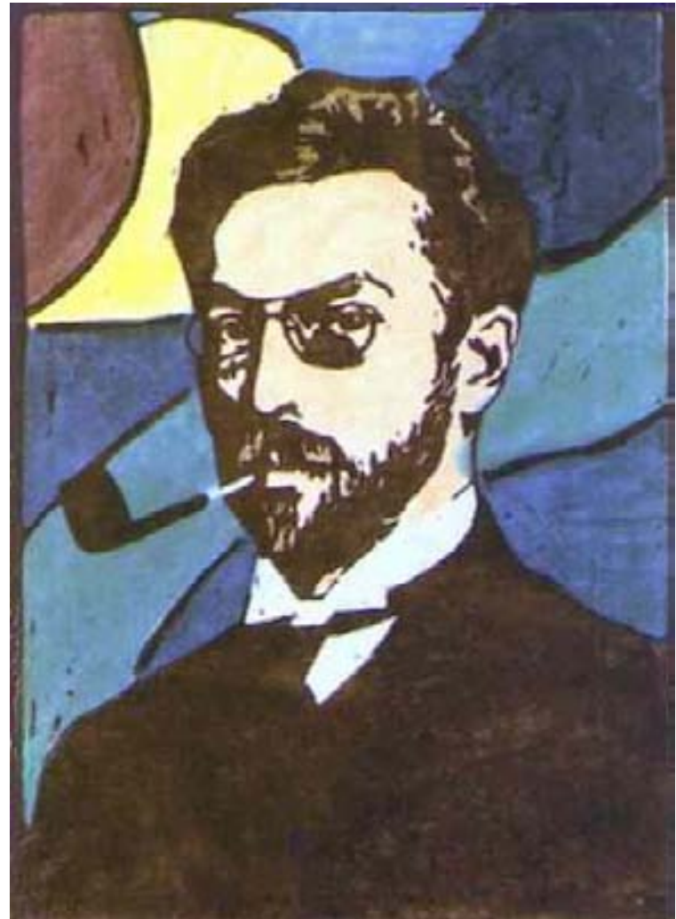
Gabriele Muntz, Portrait of Kandinsky , 1906