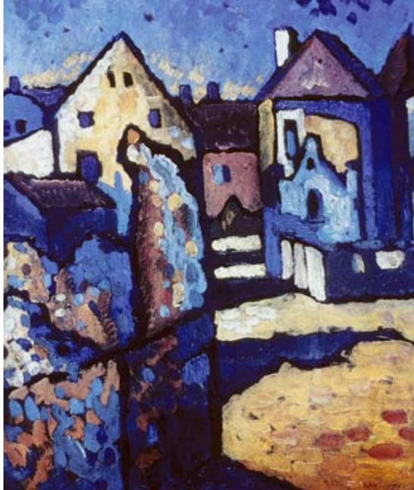
Street Scene, 1908-10