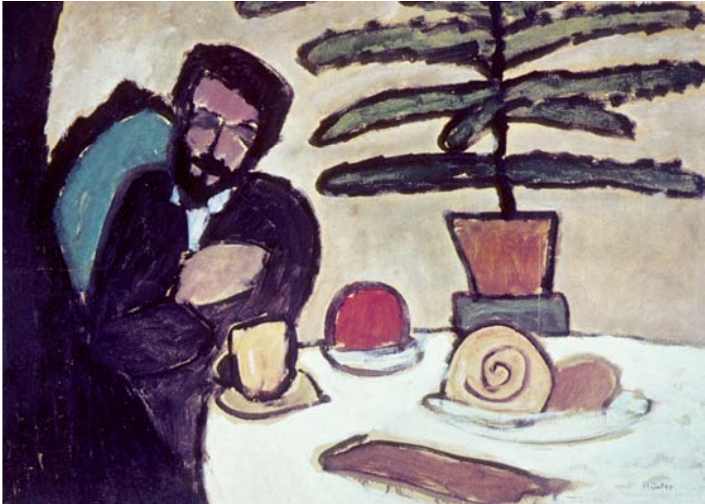
Kandinsky at the Table, 3815