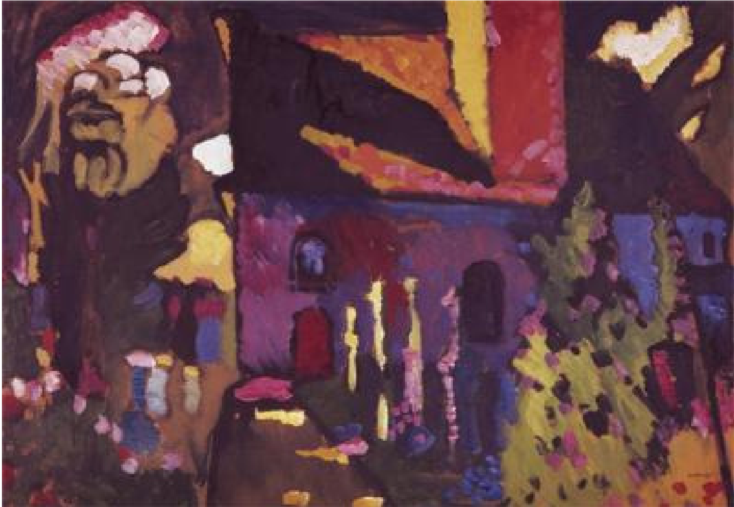
Church at Murnau, 1909