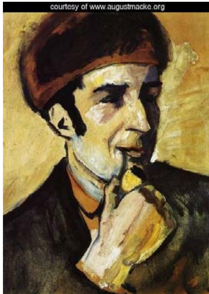
August Macke, Portrait of Franz Marc , 1910