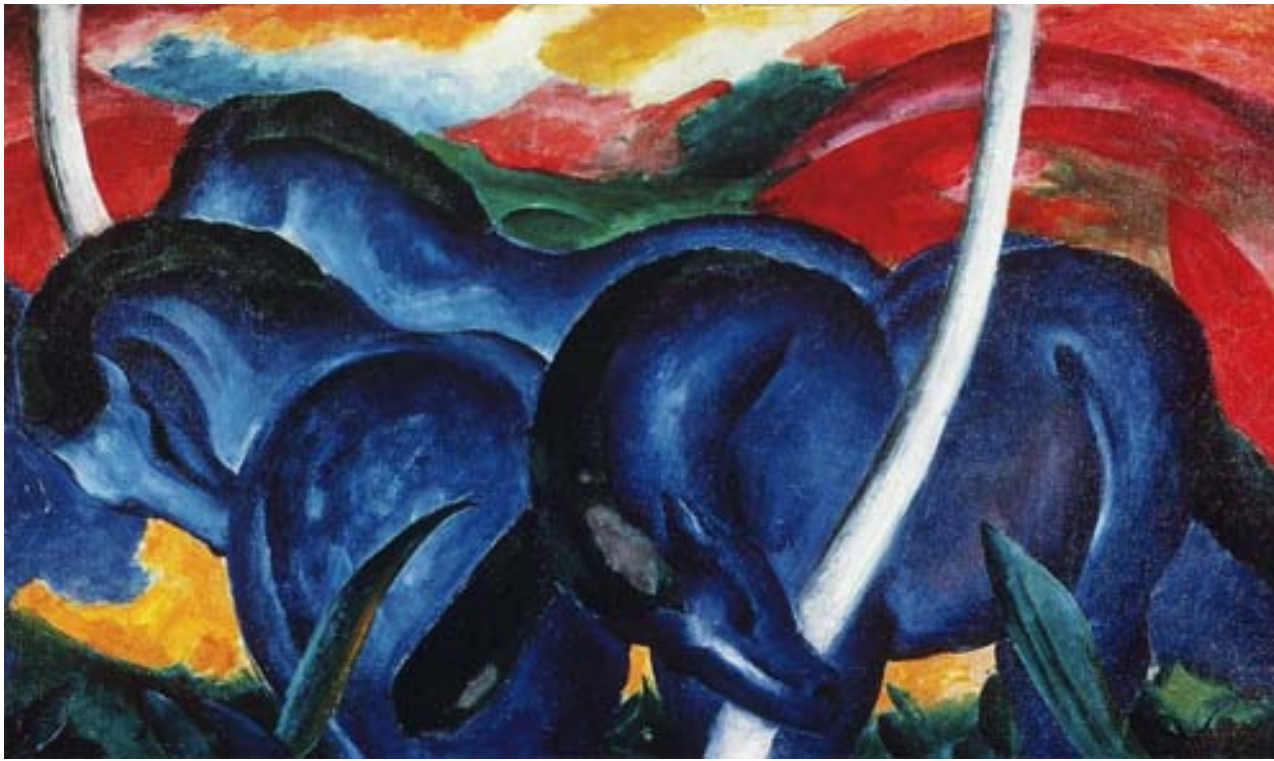
Franz Marc, Blue Horses , 1911