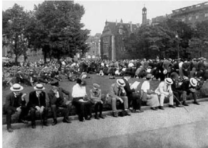
Anticipating World War I, Berlin, 1914