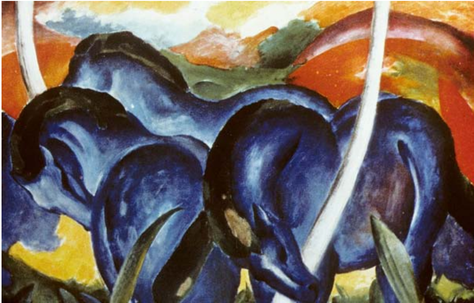
Blue Horses, 1911