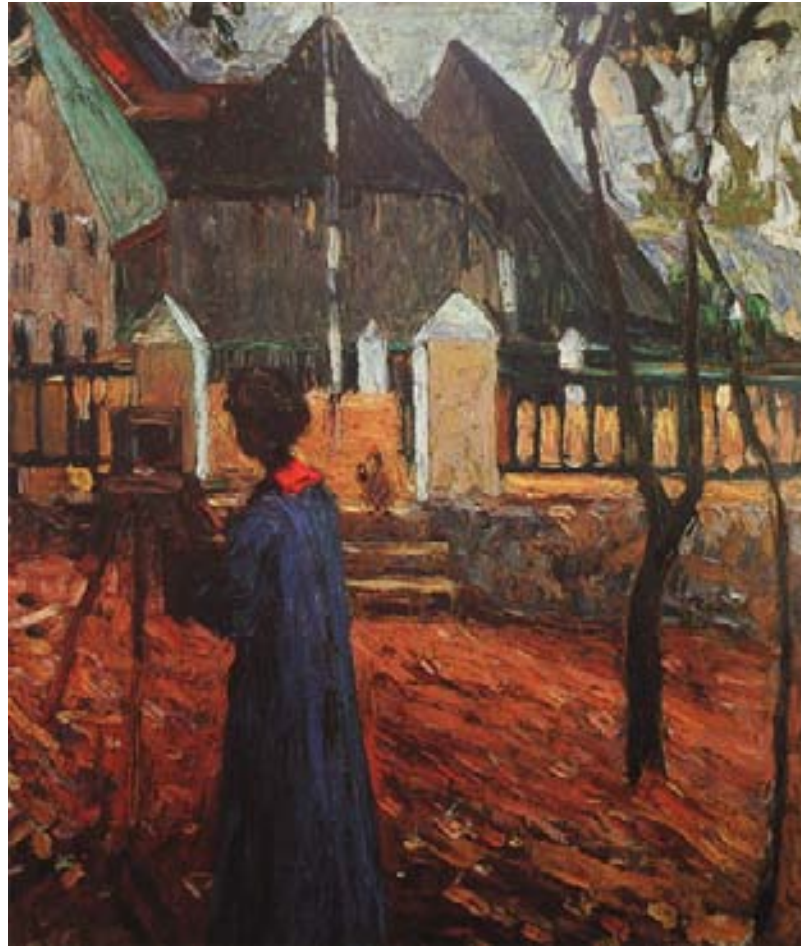
Gabriele Muntz Painting, 1903