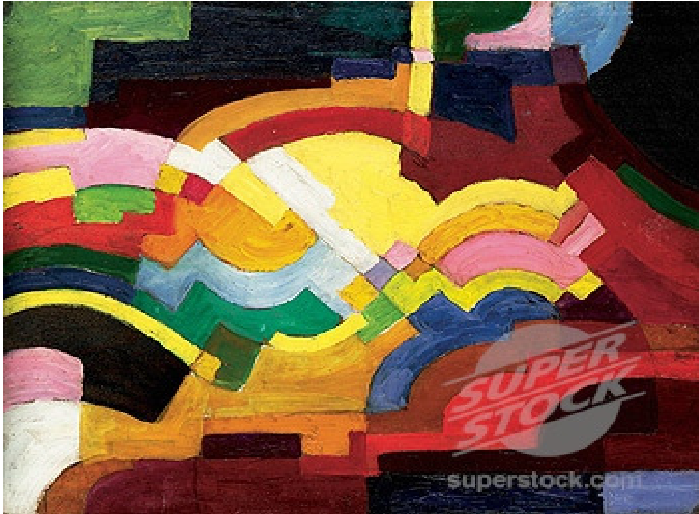
Color Forms III 1913