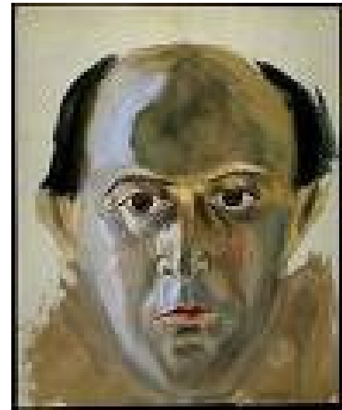
Arnold Schoenberg, Self Portrait,