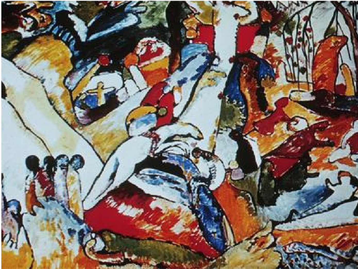
Study, Composition #2 , 1910