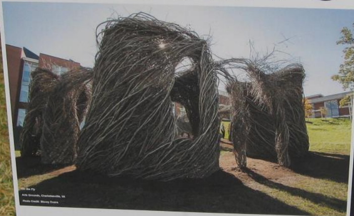
On the Fly The University of Virginia, VA