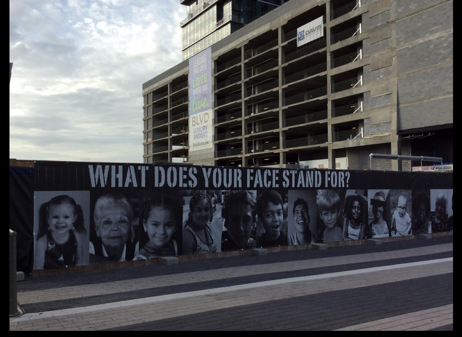
We Make Reston, 2015, Wiehle-Reston East Metro Station