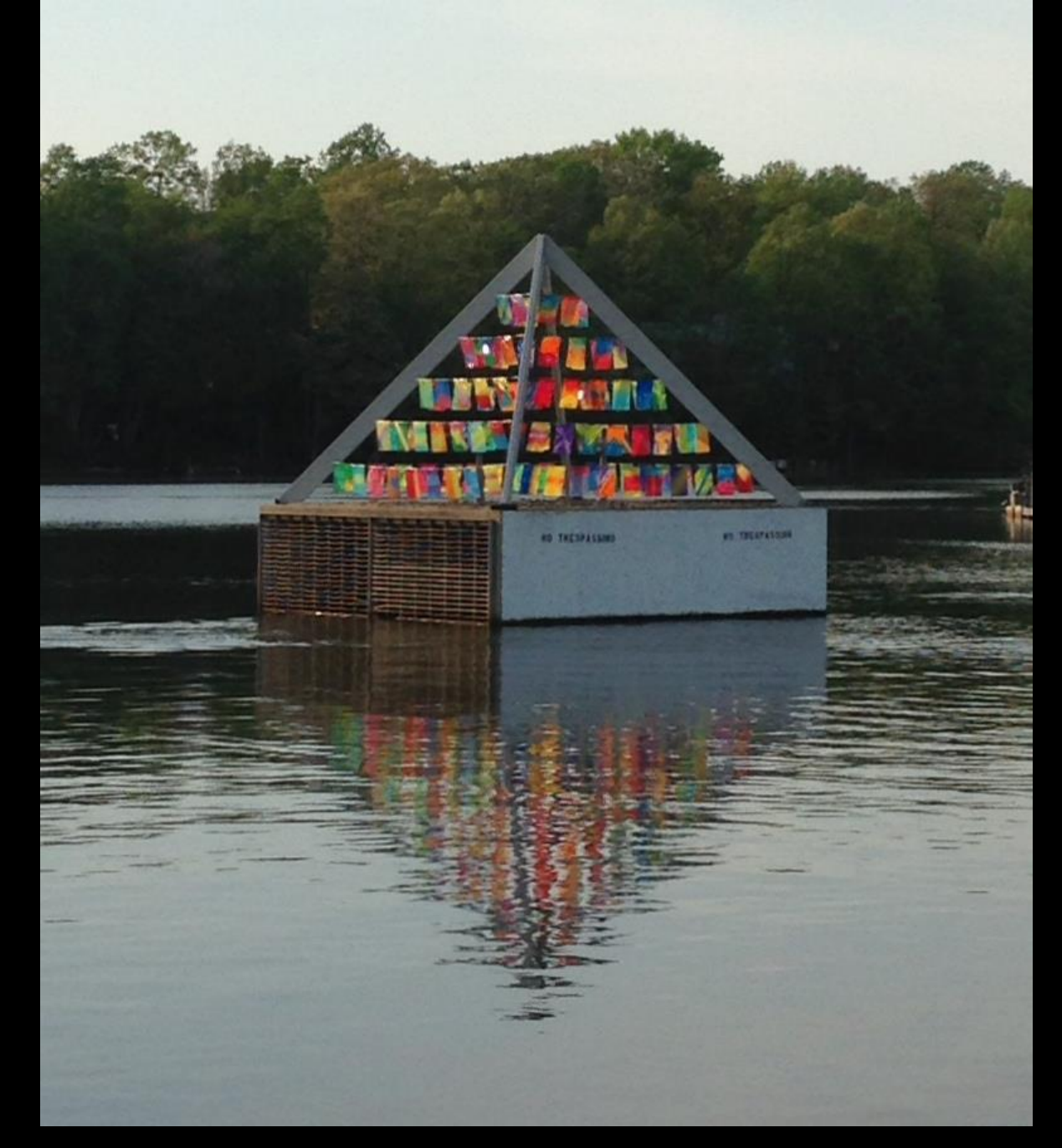
Pyramid of Light, South Lakes HS STEAM Team, 2014, Lake Thoreau