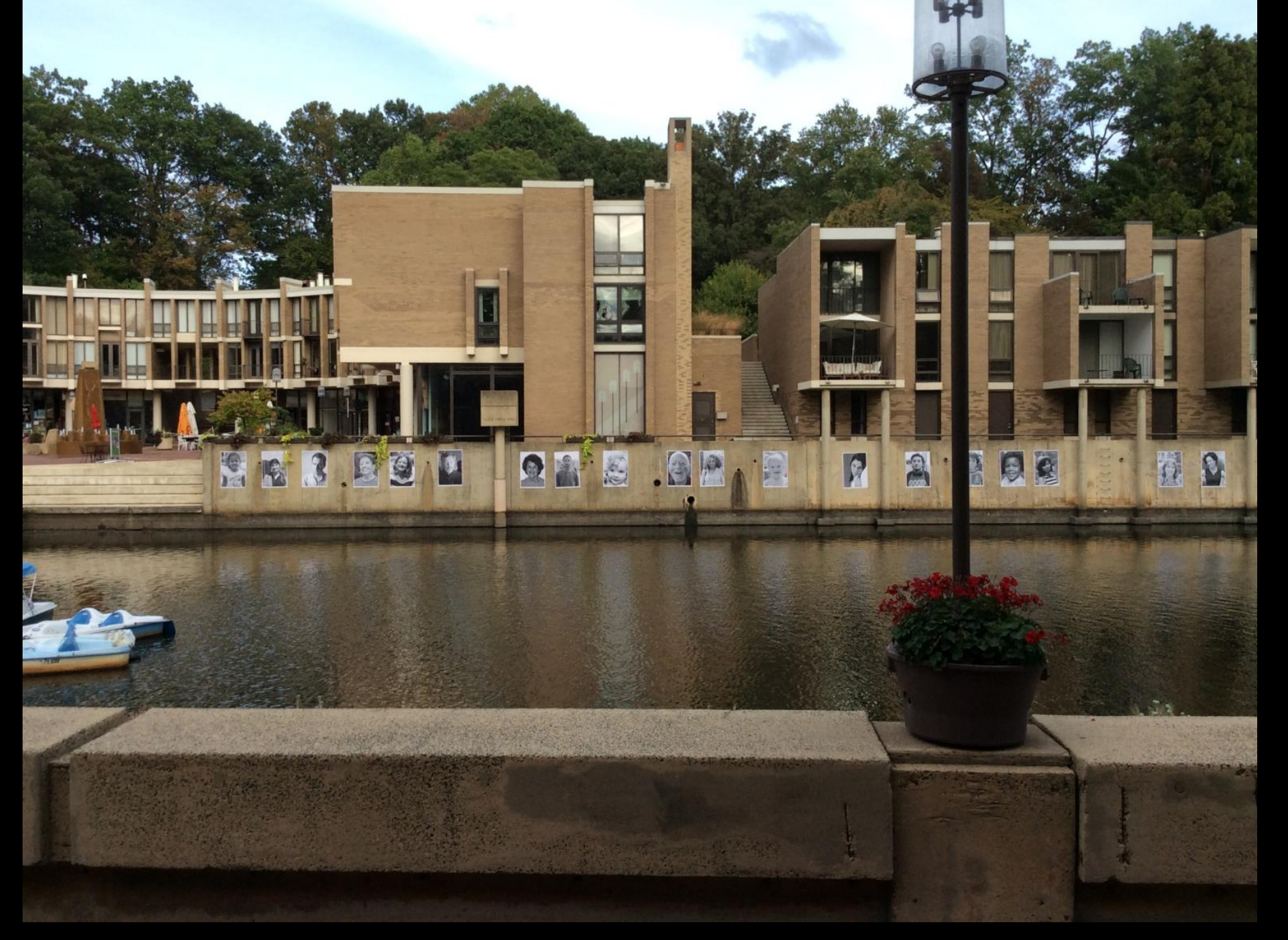
We Make Reston, 2015, Lake Anne Village Center