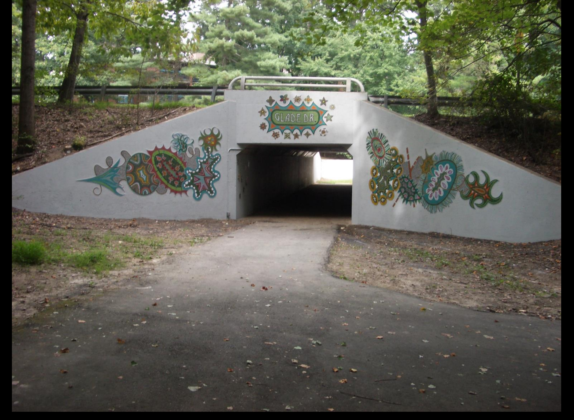
Emerge , Valerie Theberge, 2010, Glade Drive underpass