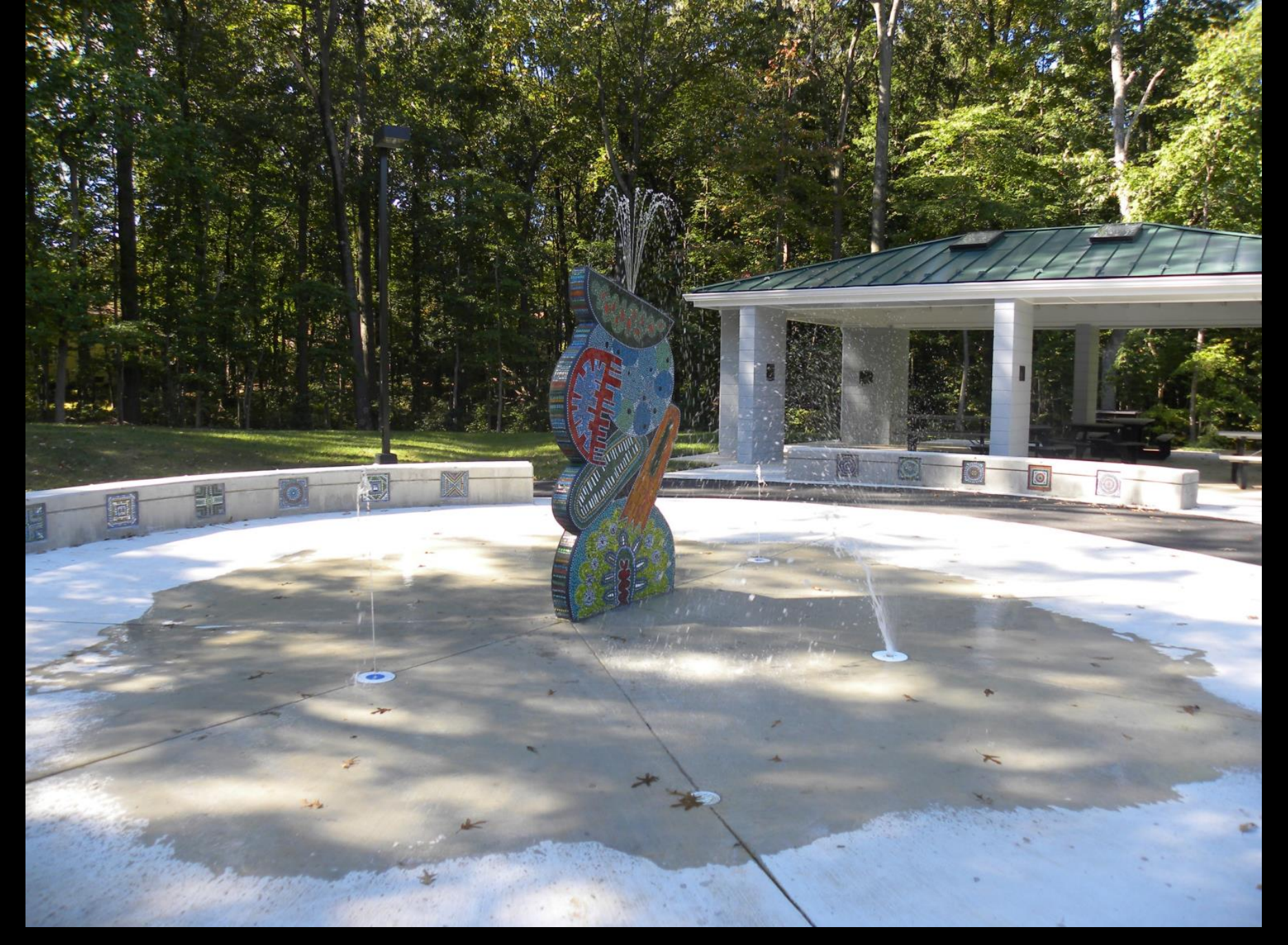
Flux, Valerie Theberge, 2013, Dogwood Pool