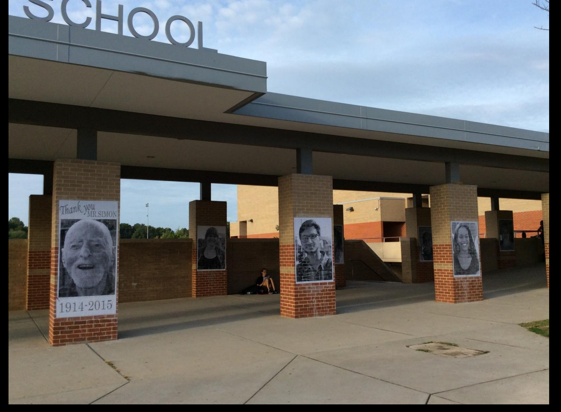
We Make Reston, 2015, South Lakes High School