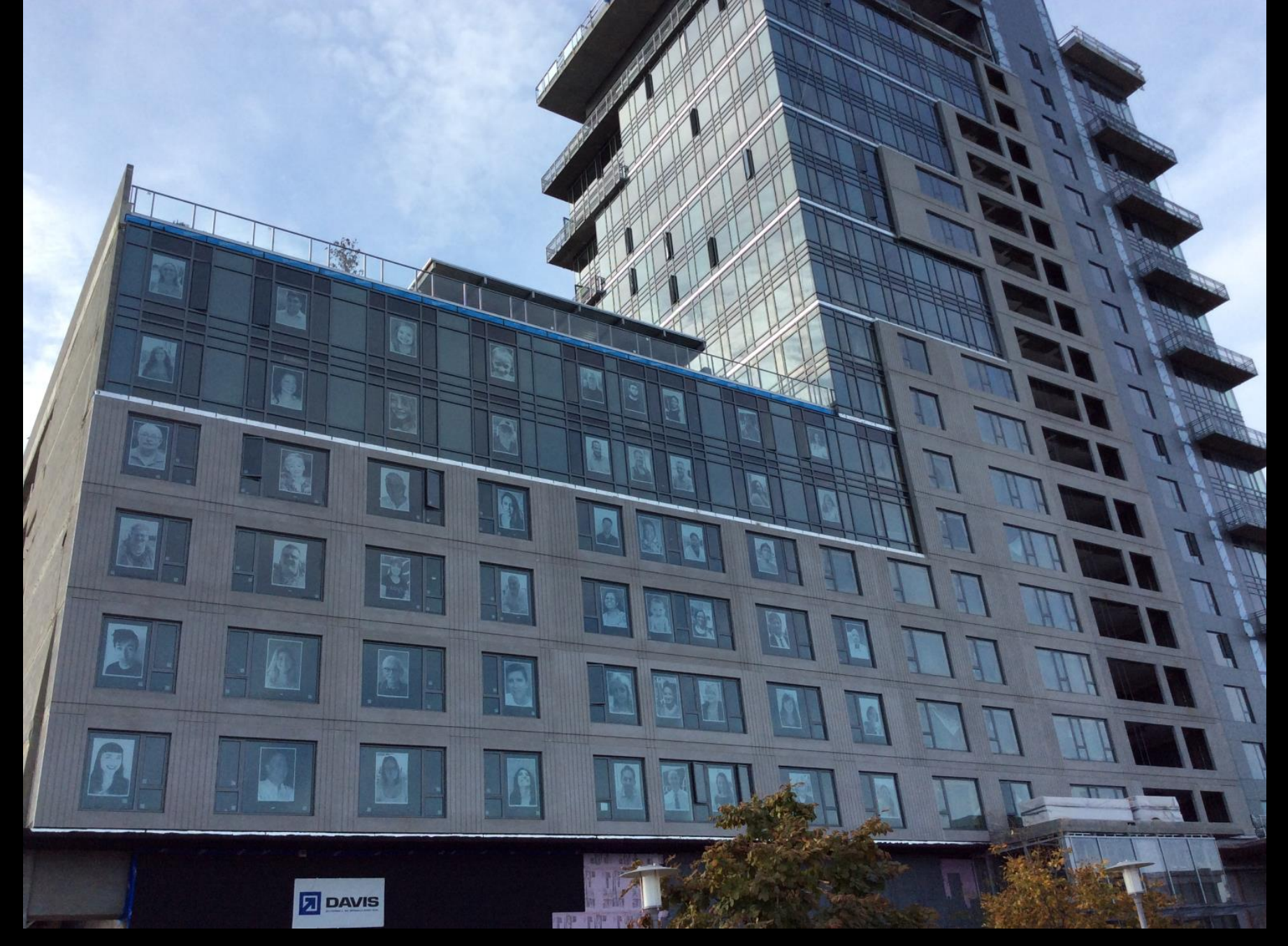
We Make Reston, 2015, Wiehle-Reston East Metro Station