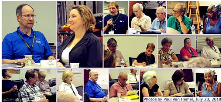
Board of Directors Meeting, Tallwood, July 20

Website What's New Catalog DocStore Facebook Officials Member Portal Contact Us Loudoun Newsletter