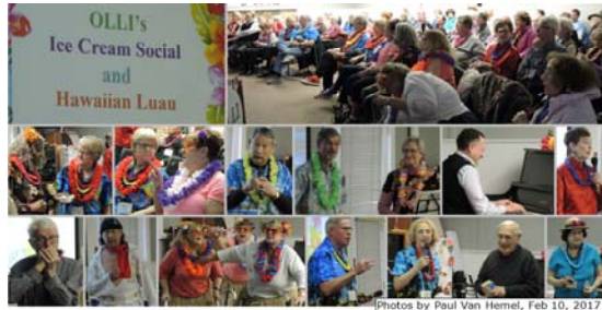
Ice Cream Social, Hawaiian Luau, and Talent Show, Tallwood, February 10, 2017 (Click Here for More)

Website What's New Catalog DocStore Facebook Officials Member Portal Contact Us