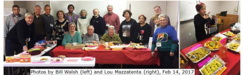
Feb 14, 2017