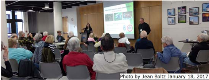
January 18, 2017

Website What's New Catalog DocStore Facebook Officials Member Portal Contact Us