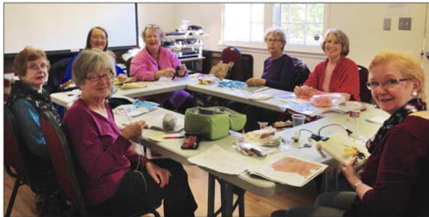
The Craft and Conversation group deep in.....crafts and conversation!