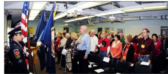
Fairfax County Police Honor Guard presents the colors.

The program began with the Presentation of the Colors by the Fairfax County