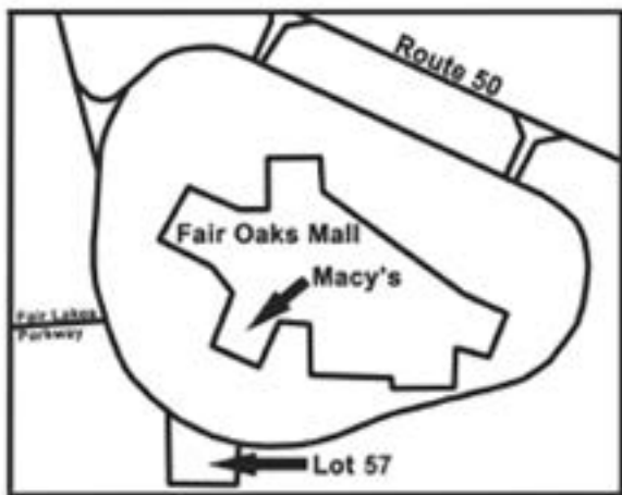
Bus Trip Pick up Location

1. Mason-in-Loudoun is located at 21335 Signal Hill Plaza, Sterling, VA 20164 across Route 7 from the Potomac Run Shopping Center.